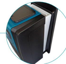
Anti-propagation joint serial Inner tray attached to totem pole