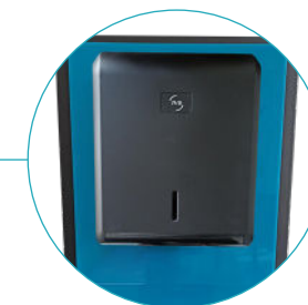
Gel or Towel Dispensers*