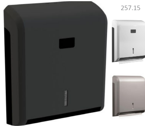
Hand towel (manual)